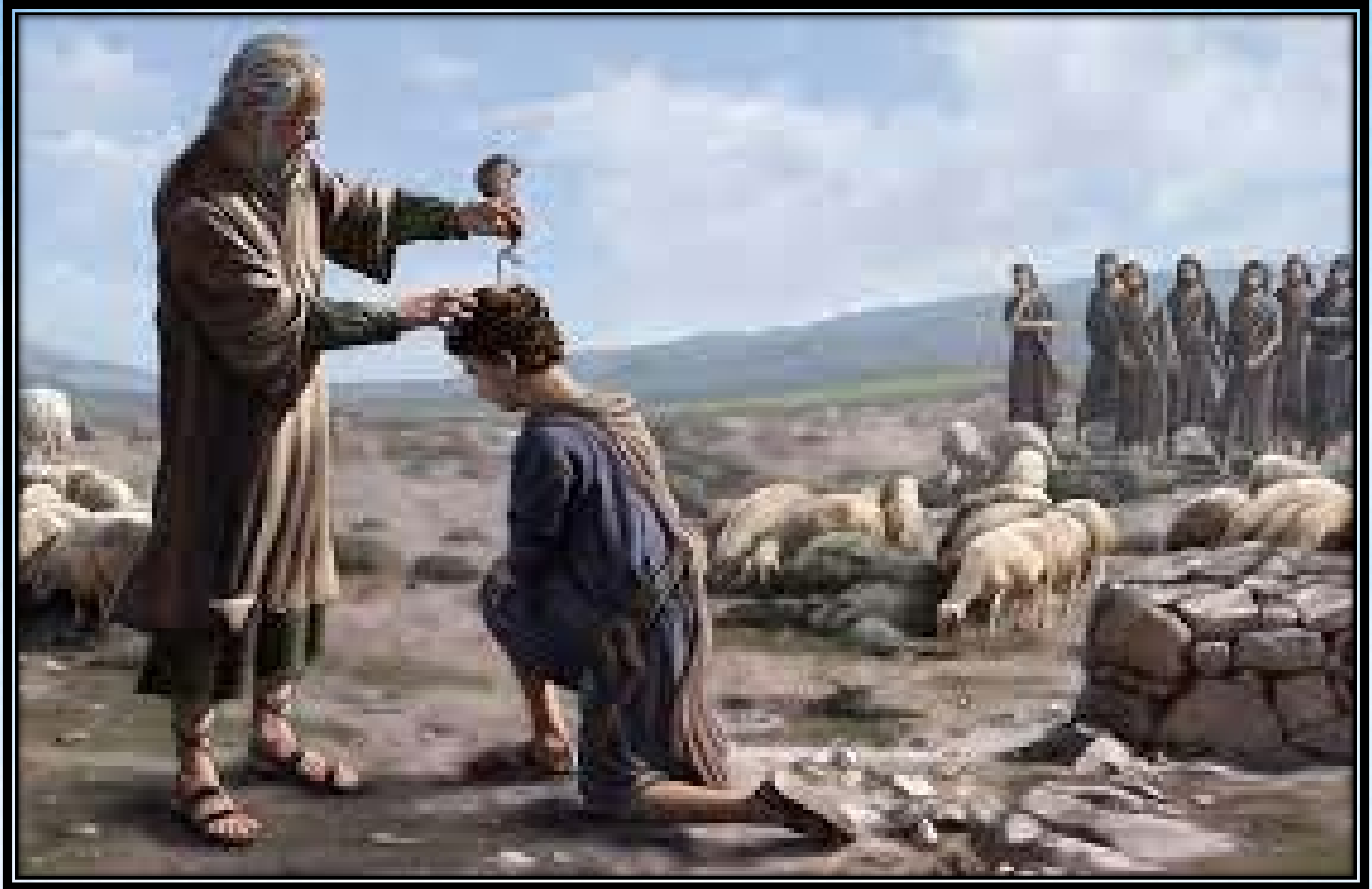
Samuel Anointing David